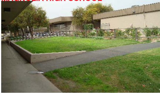
Need to replace 15 portables with permanent classrooms.