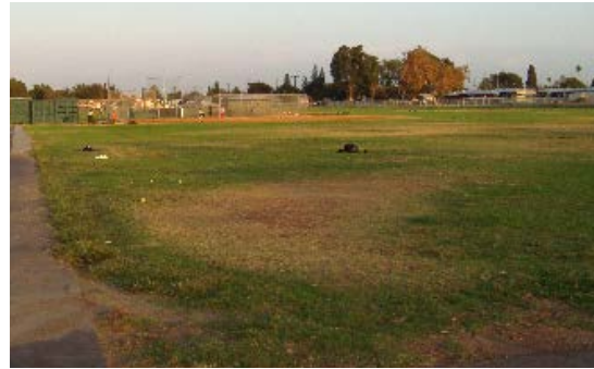
Need to recondition fields.