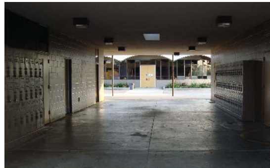
Need to remove lockers at finger plan buildings and courtyard.