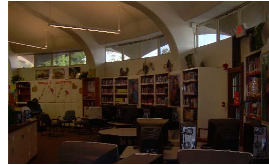
Need student union / media center for student interaction and collaboration.