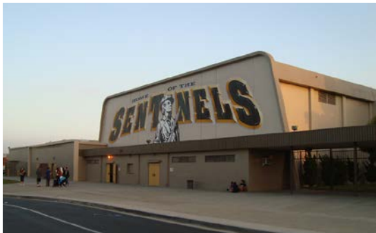
Need to add a second (practice) gym.