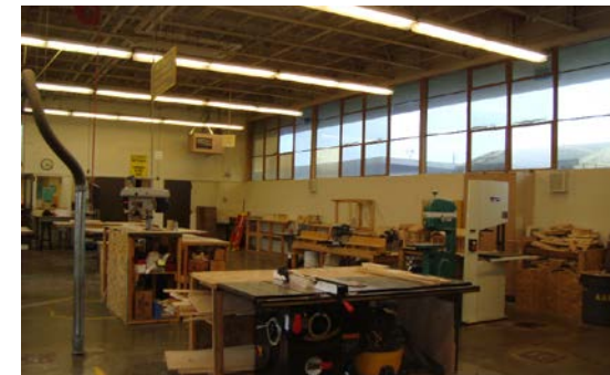
Most campus windows are old and need replacement.