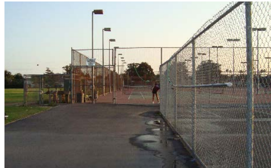
Minor ponding and drainage issues on campus.