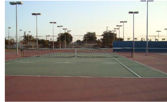
Tennis courts need to be replaced.