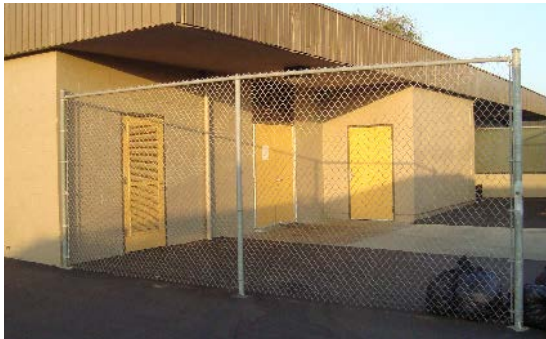
Need 4,000 l.f. of fencing to secure campus.